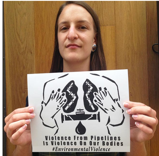
Example: Chestplate stencil photo