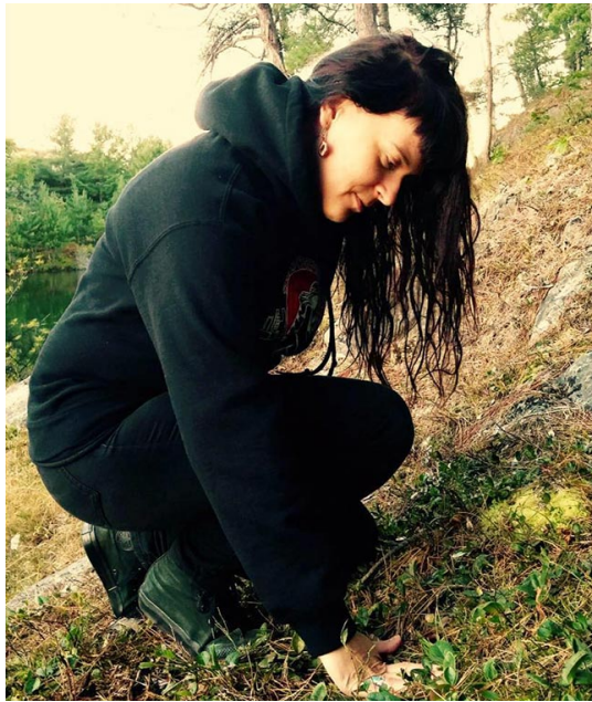
Example: Hand to the Land photo